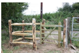
Getting more done